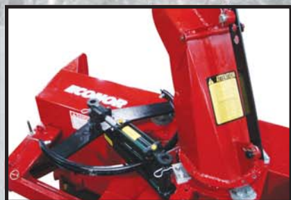
Chute rotation with steel wire (cradle type) and cylinder (optional) E48-200 to E78-240