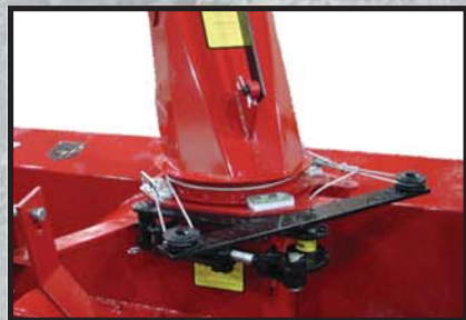
Chute rotation with steel wire (pulley type) and cylinder (optional) on E86-260 and E94-260