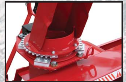
Chute rotation on polyethylene UHMW