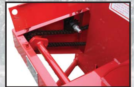
Safety bolt on driving shaft

Gap rod for deflector adjustment (standard)