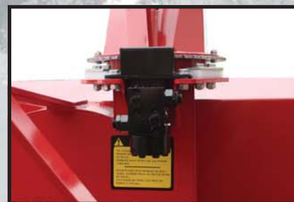
Hydraulically-powered chute rotation (optional)