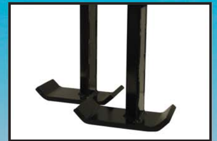
Adjustable skid shoes (optional)