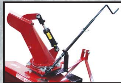
Manual chute rotation and hydraulic deflector (optional)