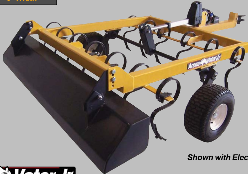
Shown with Electric Actuator